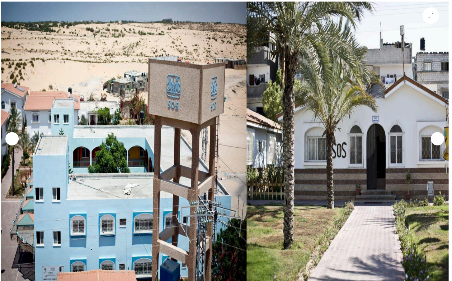
SOS Children's Village with the orphanages before the attack.